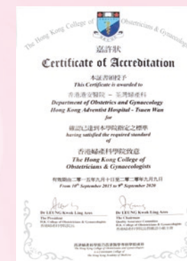
Hong Kong College of Obstetricians and Gynaecologists 香港婦產科學院