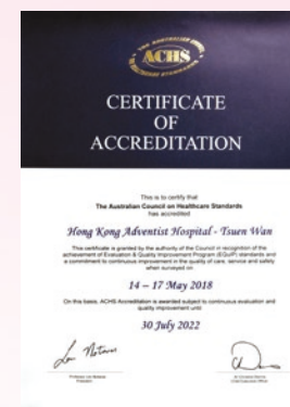
Australian Council on Healthcare Standards 澳洲醫療服務標準委員會